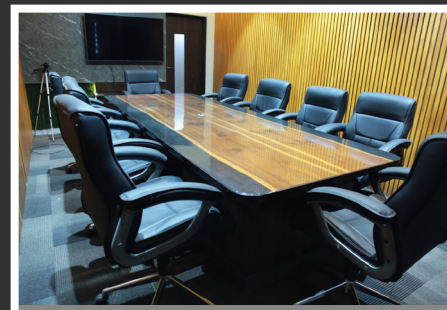
White House Board Room(A/C) | 10 No.

For FTCCI Members 20% Discount on Hall Charges