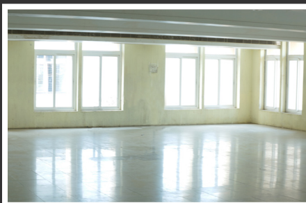
Dhanjibhai Sawla Hall (A/C) | 2500 sft