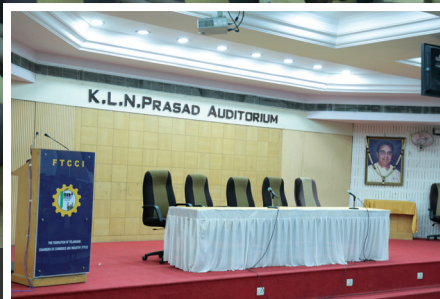
K.L.N. Prasad Auditorium (A/C) | 350 No.