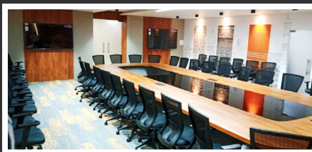
J.S. Krishna Murthy Hall (A.C) | 40 No.