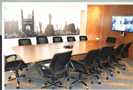
OPT Board Room(A/C) | 14 No.