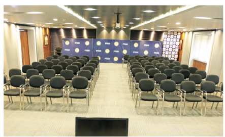
FTCCI Surana Auditorium (A/C) | 130 No.